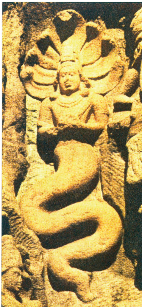
Photo: National Geographic, Vol. 138 nr. 3, (Sept. 1970), page 393; no indication about photographer and object.

of Lord Shiva and Lord Vishnu. Shiva is wearing the snake primarily as an ornament, around the knot in his hair, around his shoulder as sacred thread, as a belt around his waist and as bracelets and anklets. In one of the prayers to Shiva, one of his